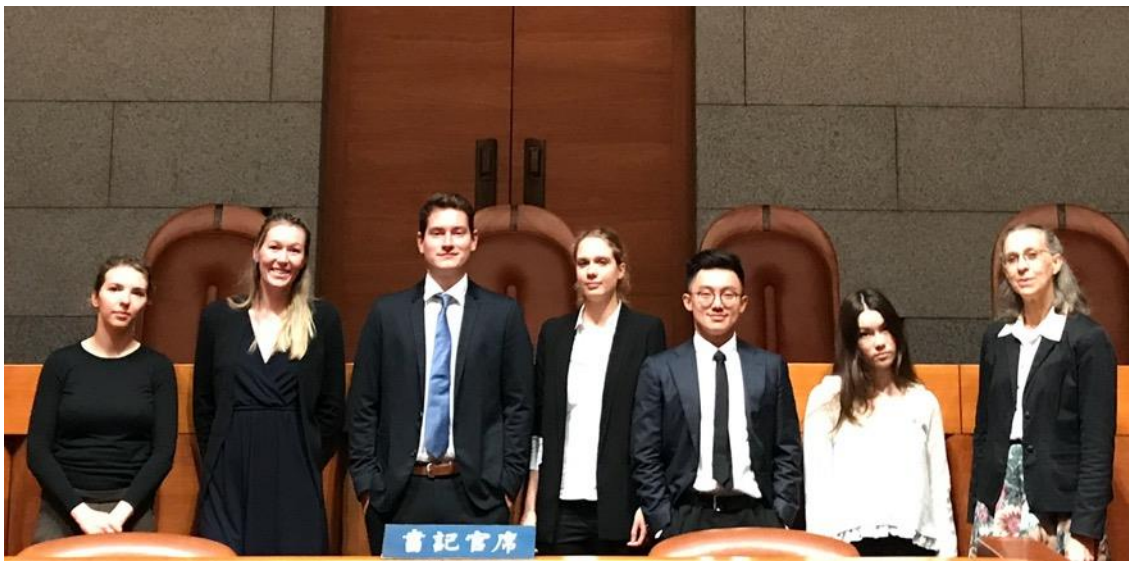
Class of 2019 at the Supreme Court of Japan