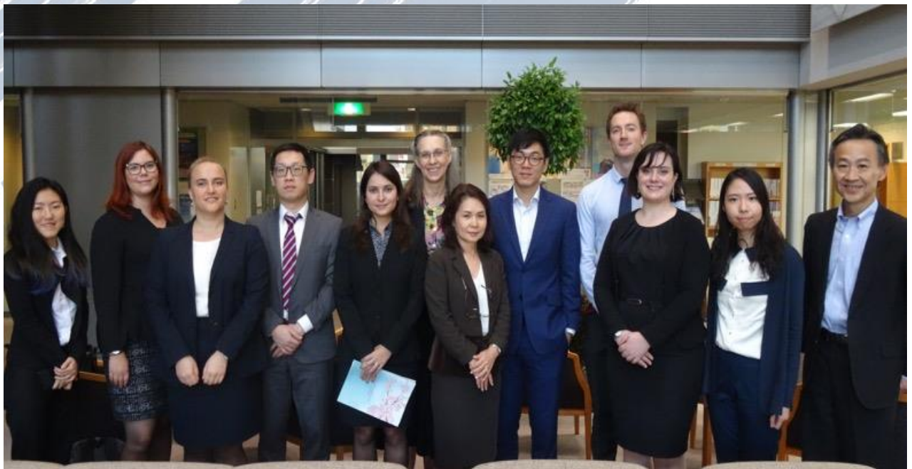
Class of 2018 at the Japan Federation of Bar Associations (Nichibenren)